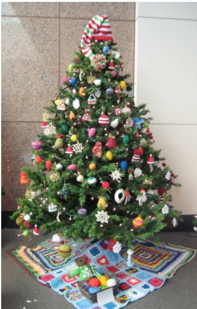
Love Cap volunteers made a splash at the Festival of Trees. Our tree, sponsored by Fred's, Inc., was resplendent with knitted and crocheted ornaments.

Fall 2008 was a whirlwind of activity! We gathered for our annual party in October, Temple Israel held Mitzvah Day in November and Love Cap volunteers wowed Memphis with our decorations at the Festival of Trees. The grand total for 2008 was an impressive 3142 items. Look inside for more photos and details.