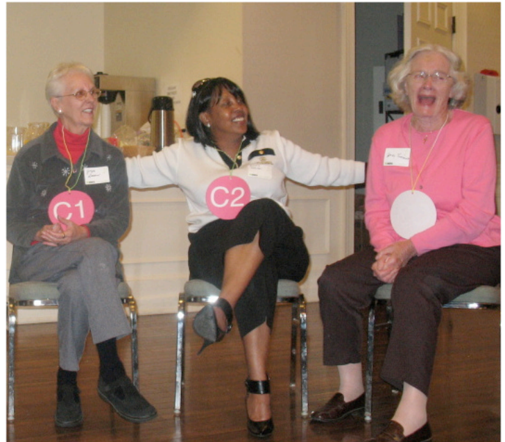
The annual Love Cap celebration and ingathering featured a trivia quiz contest. Members of Team Crochet, pictured above, celebrate their victory over Team Knit.