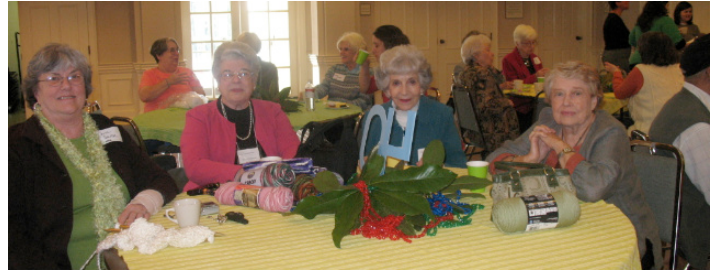
Partygoers enjoyed stitching, chatting, collecting new yarn and sampling delicious homemade muffalettas made by BJ and Miki (top photo).