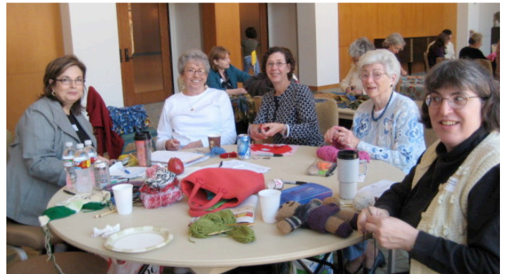
Temple Israel knitters gather for Mitzvah Day. Members also assembled birthday bags for meals recipients and performed acts of kindness throughout the community.